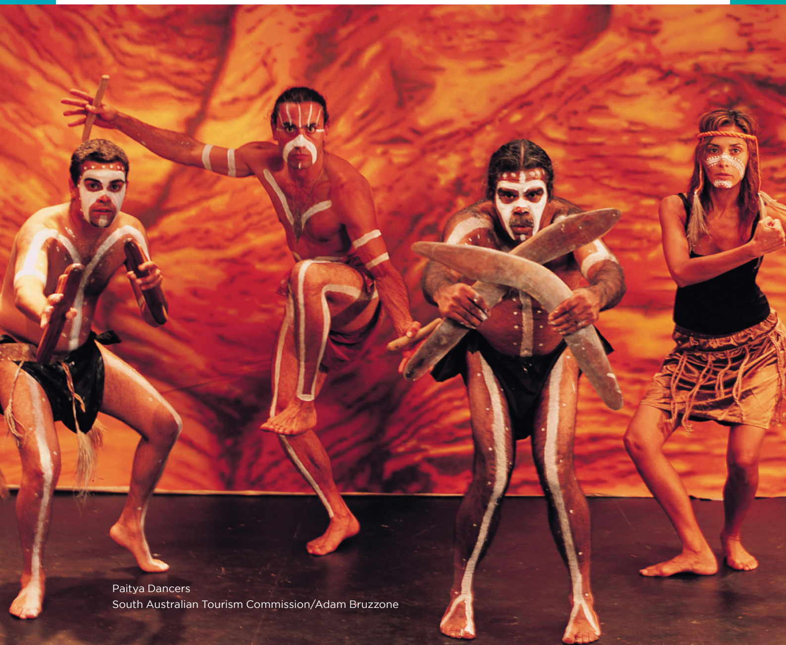
Paitya Dancers

Through the Adelaide City Deal key tourist sites will also be revitalised to improve the visitor experience and provide a boost to the local visitor economy – further driving investment and growth.